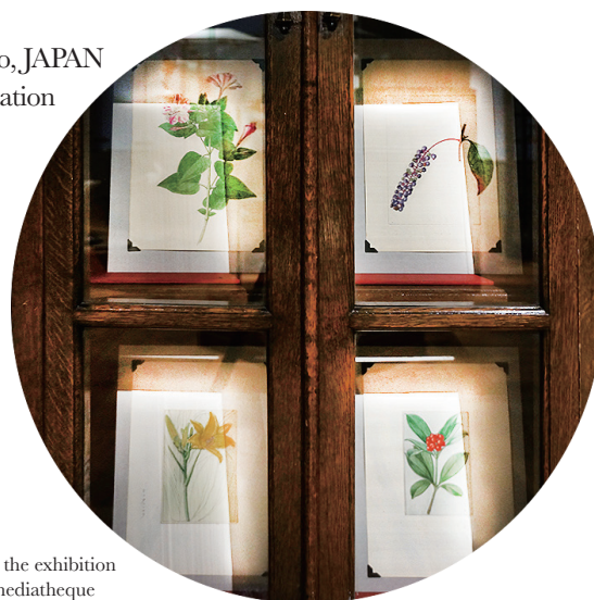
View of the exhibition

From Japan: 050-5541-8600 (NTT Hello Dial Service)